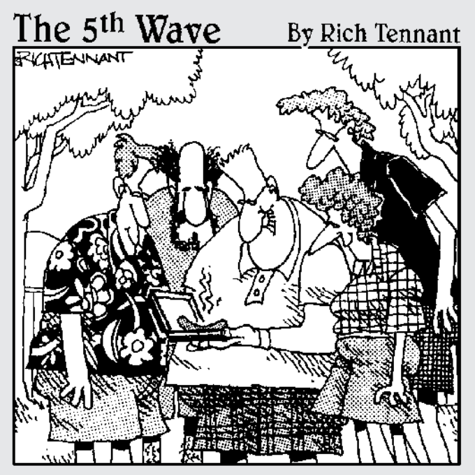
"It's a Weber PalmPit Pro Handheld barbeque with a 24 btu, rechargeable battery pack, and applications for roasting, smoking, and open-flame cooking. Can you believe there was no reserve?"