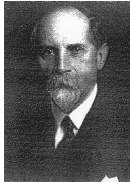
Adolf Meyer (1866–1950)