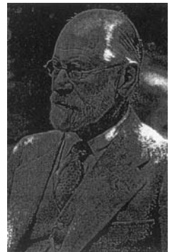
Sigmund Freud (1856–1939)