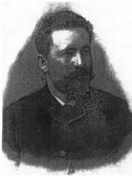
Emil Kraepelin (1856–1926)