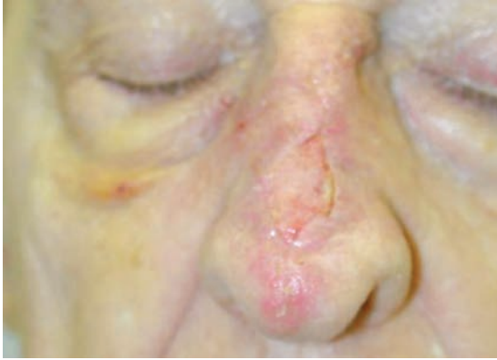
Figure 5 One-week follow-up.