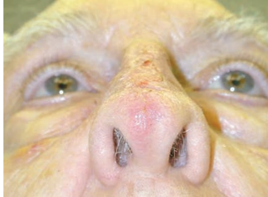
Figure 7 The nasal ala are widely patent, and elevation of the ala is imperceptible at 4 weeks.