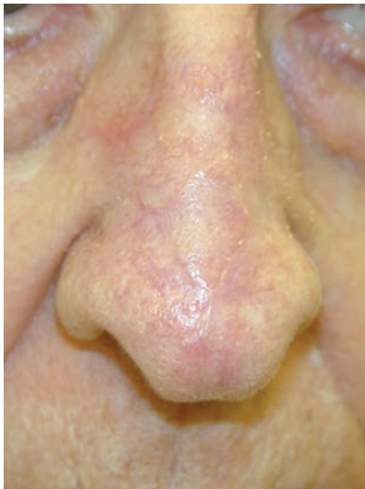
Figure 6 Four-week follow-up.

· When choosing a reconstructive option, both the patient and the surgeon must understand the pre- and