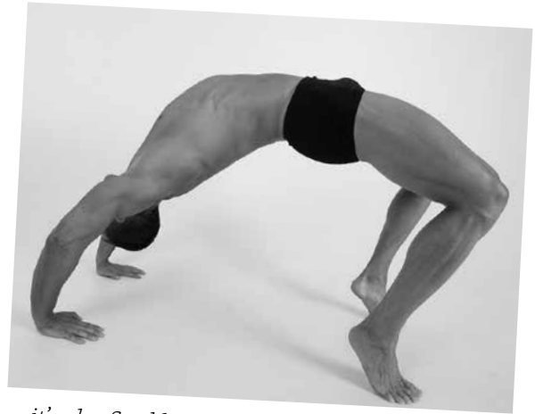
... it's also flexible!

Don't put unnecessary pressure on yourself. Nowhere else are promises so lightly made and tricks so casually employed as in the health and fitness industry. Don't be put off by those fitness models who smirk at you from magazine covers. Those photos are almost always the product of diuretics and other drugs, extreme dieting, fake tans, a good pump, and oil, plus perfect lighting and the magic of Photoshop editing. Don't get me wrong, the models still deserve credit, but I assure you they don't walk around looking like that on a daily basis. Quite the contrary! And forget the massive bodybuilders—most of those guys aren't fit at all. In fact, their addiction to more muscle at all costs compromises their health and athletic performance. In my view, it's a backwards approach: they train to look like they have a lot of physical ability, but their methods often lead to injuries, long-term health problems, and very little functional value outside of the gym. You and I, we will train to attain physical ability. And an attractive physique will be the by-product, because it's the appearance of ability, and the confidence that comes with it, that people are attracted to, not the muscles.