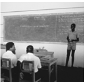
Fig. 1.3 |

Some consider the global US-American influence a great progressive force as politicians and the film industry have disseminated values and vistas of a democratic and capitalist culture as a potentially liberating alternative to authoritarian and repressive traditions. Others have criticized the rise of ‘American cultural imperialism’ as the ‘McDonaldization’ of the world (cf. Bryman 2004, Ritzer 2011). Linguists advocating language rights, such as Phillipson and Skutnabb-Kangas (cf. 2011: 28–30), consider the domination and teaching of English in close connection to US-American neoliberal ideology and economy as linguistic imperialism that continues colonial practices even today. Education in the medium of English deprives indigenous and minority children of their languages and the “intergenerational transfer” of culture and identity: English ‘kills’ other languages and cultures if it is not added as an L2 to education in the mother tongue (ibid.: 33–34). Whichever perspective is taken, Great Britain and the USA have been major forces in driving globalization and making English a global language.