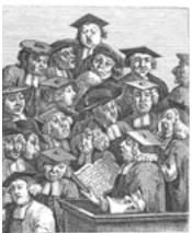
Fig. 1.1 |

William Hogarth: Scholars at a Lecture (1736)