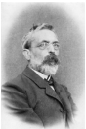
Fig. 1.4 |