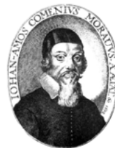
| Fig. 1.2